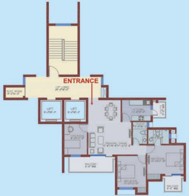
2 BHK with Kids Room 1618 sqft*