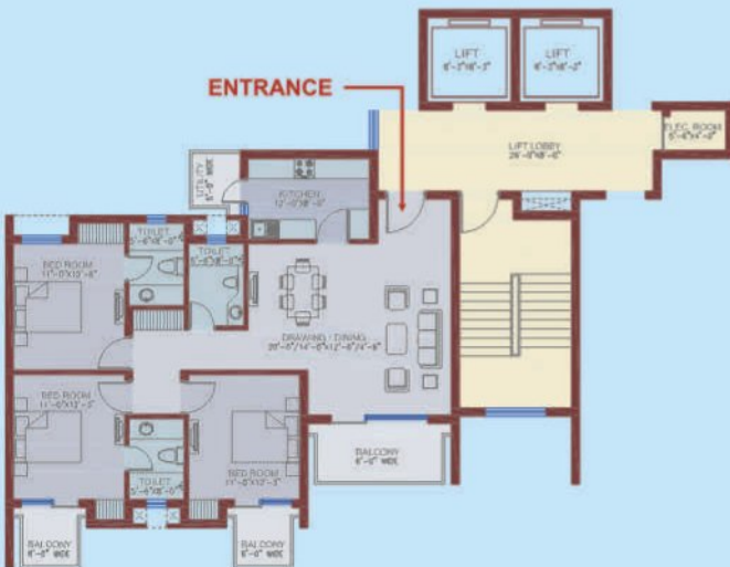
3 BHK Apartments 1877 sqft*