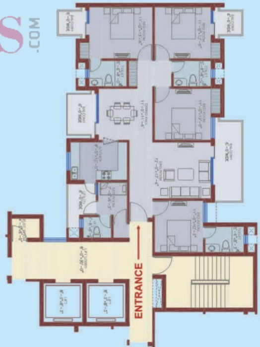
4 BHK Apartments 2321 sqft*

1 sq mts = 10.76 sq ft, 1 sq yards = 9 sq ft, 1 sq mts = 1,196 sq yards