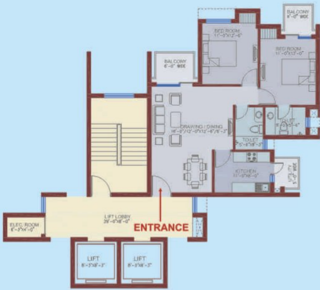
2 BHK Apartments 1348 sqft*